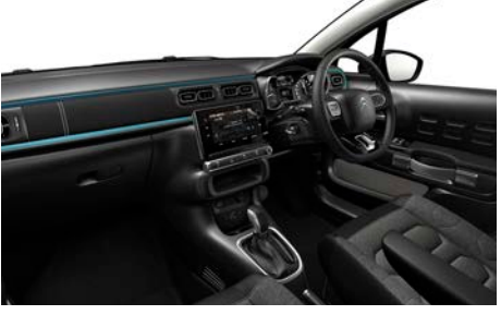
EMERALD AMBIANCE (Optional on all models)