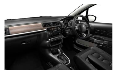
TECHWOOD AMBIANCE (Optional on all models)