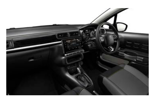
STANDARD AMBIANCE (Standard on all models)