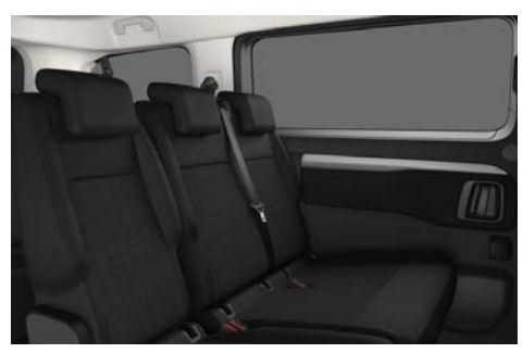
'CURITIBA TRITON' CLOTH TRIM (Standard on all models)