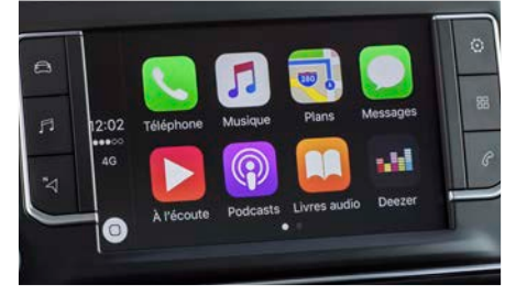
CITROËN CONNECT PLAY