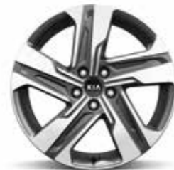
K3 PHEV, Special Edition - 19" alloy wheels