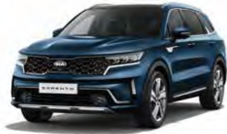
Gravity Blue (B4U)