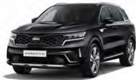
Aurora Black Pearl (ABP)