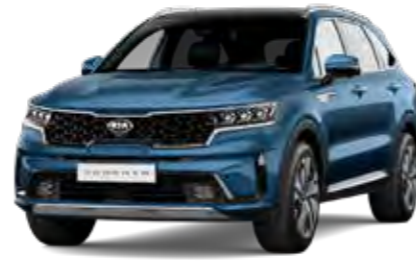
Mineral Blue (M4B)