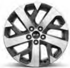
K3 Diesel - 18" alloy wheels