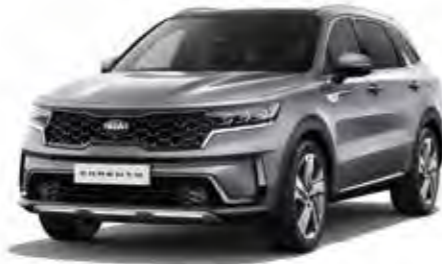
Steel Grey (KLG)