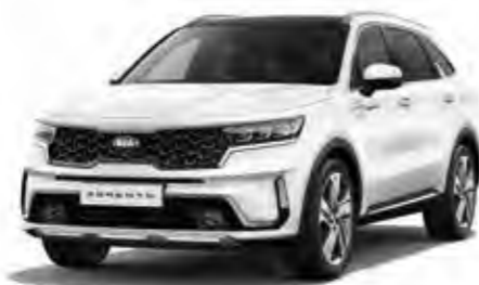
Snow Pearl White (SWP)