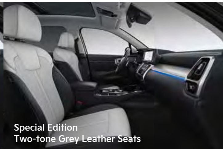
Special Edition Two-tone Grey Leather Seats

Note: Mood lighting strip not standard on K3 model